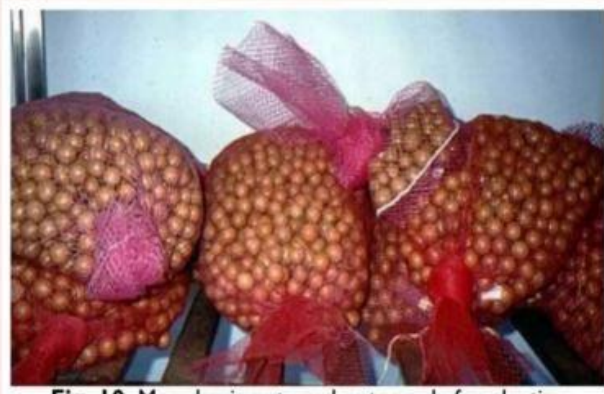
Fig. 10. Macadamia nut seed-nuts ready for planting