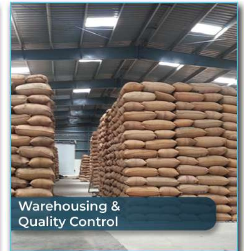
Warehousing & Quality Control