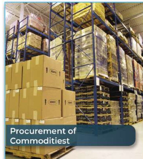
Procurement of Commodity